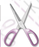
Table of Coupon Contents